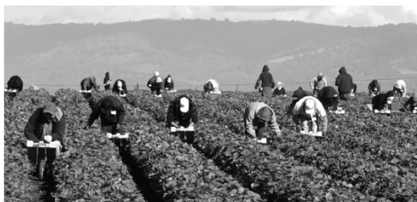
Fresno is in the middle of the Central Valley in California, one of the highest-producing agricultural regions in the country. Yet many people here lack access to healthy food. The U.S. Dept. of Agriculture calls Fresno a "food desert."

The closest supermarket is five miles away from our home. I shop there once a week, and I look for special sales on fruits and vegetables. Also, I buy seasonal fruit at the nearest farm outside the city or at the closet community garden. There are some gardens in Fresno, like Al Radka