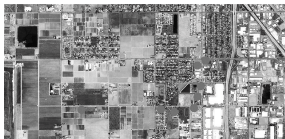
This interactive "soundscape map" allows you to listen to the sounds of food being prepared and eaten in Fresno, CA. Go to < berkeley.news21.com/theration/soundscapes > and click on the various dots to listen.