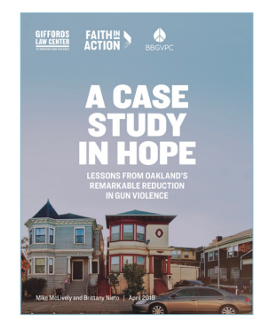
Giffords Case Study for Hope