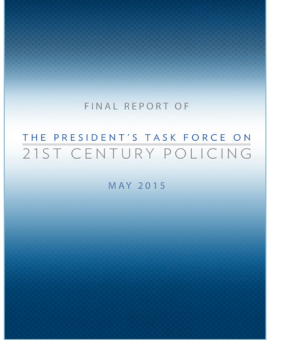
21st Century Task Force on Policing